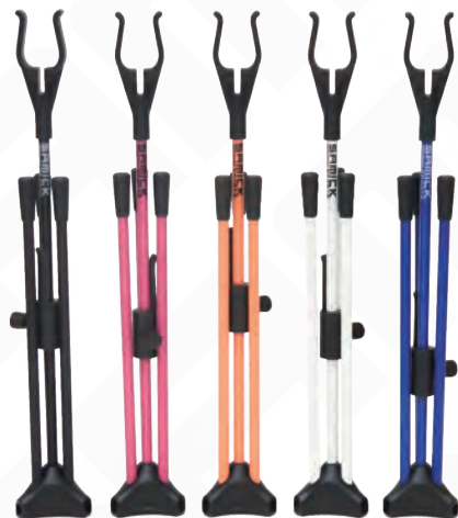
Black Pink Orange White Blue